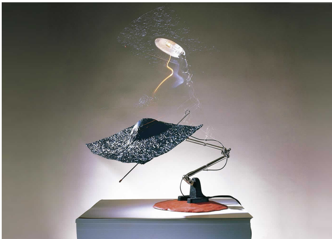
Don Quixote INGO MAURER UND TEAM 1989

Steel, aluminium, flexible plastic. Don Quixote bends, twists, turns and swivels.